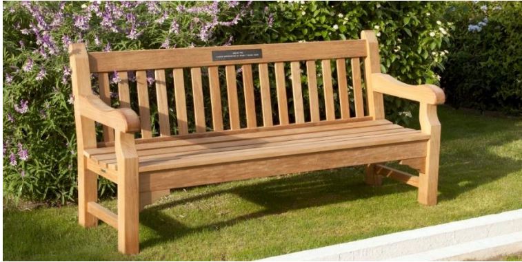
Glenham Seat 180 (1GL18) with a Bronze Plaque (5BPS)