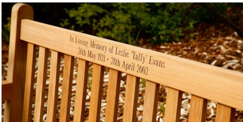
Glenham Seat 150 (1GL15) with Carved Inscription (5CA)

If you already own a piece of our furniture and would like to inscribe it then we can carve the component and have a member of our care team visit you and fit the new carved component. Our customer service department will give you a quotation for this service.